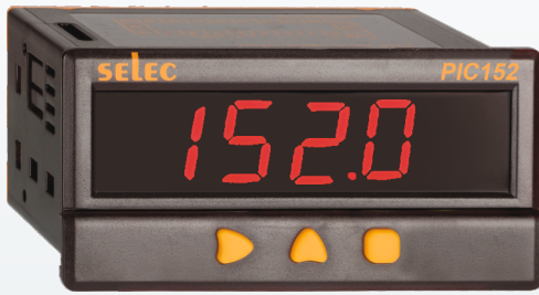
48 x 96mm