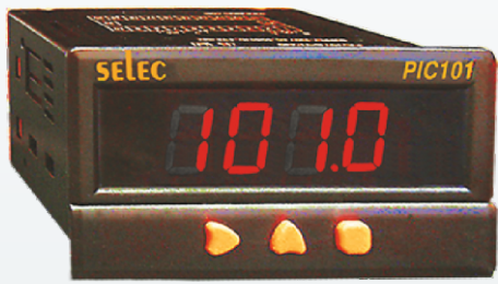
48 x 96mm