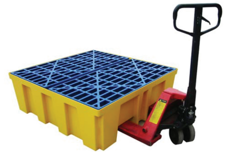
Forklift friendly: Easily re-locate your decks or pallets