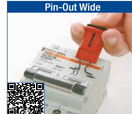
Pin-Out Wide Consult the technical datasheet LOTO-26 on bradyeurope.com/tds