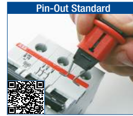
Pin-Out Standard Consult the technical datasheet LOTO-1 on bradyeurope.com/tds

* Kit contains 1 part of each (090874, 090844, 090850, 090853, 149433, 149514)