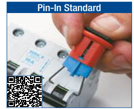
Pin-In Standard Consult the technical datasheet LOTO-25 on bradyeurope.com/tds