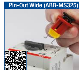
Pin-Out Wide (ABB-MS325) Consult the technical datasheet LOTO-95 on bradyeurope.com/tds