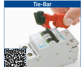
Tie-Bar Consult the technical datasheet LOTO-27 on bradyeurope.com/tds